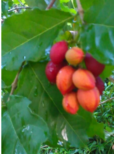
Peanut Butter Fruit - Ripe and Unripe

Peanut Butter Fruit is a small fruiting tree that thrives in Southwest Florida although it's relatively unknown here. While not commercially viable, it is a nice addition to the home garden. This attractive tree has an upright growth habit and leaves with silvery undersides. Sprays of yellow flowers, orange immature berries, and ripe red berries are present simultaneously which adds beauty to the landscape in repeated cycles spring through fall.