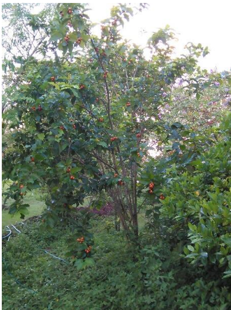
Peanut Butter Fruit Tree

Besides eating the berries straight off the tree, they can be made into jam, jelly or sauce. After the pulp is separated from the seed, it can be used in baked goods or stored in the freezer. It is said to be especially good when added to a milkshake.